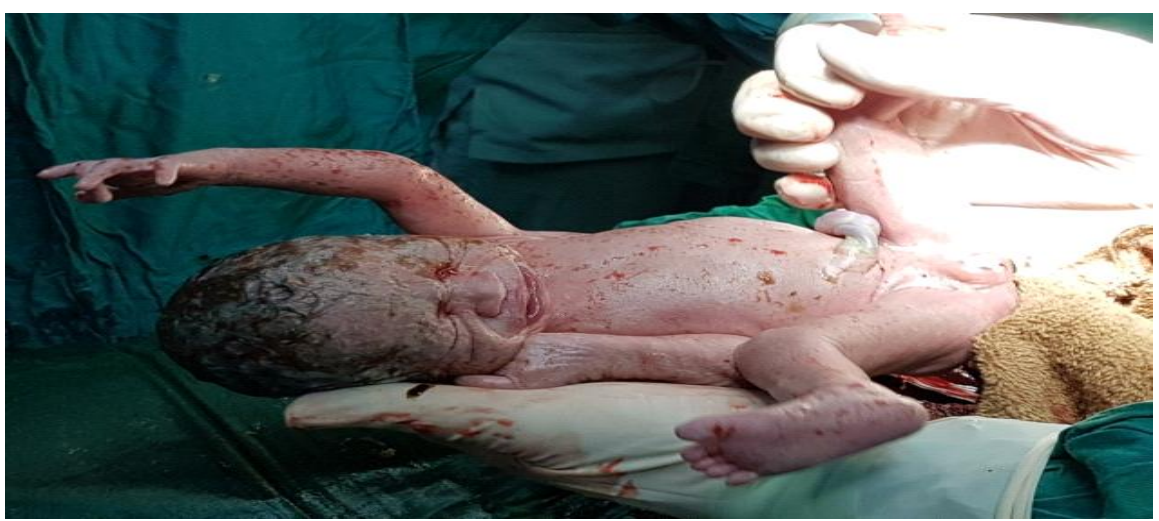
Figure 4. Neonatal outcome