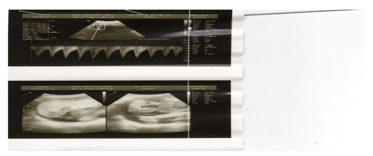
Figure 2. Umbilical artery Doppler