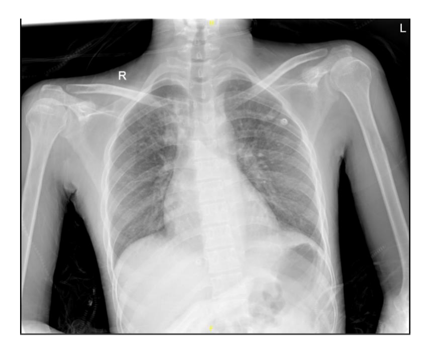
Figure 1. Patient Chest X-ray in AP (anteroposterior) view showed suprahilar and apex patchy infiltrate and prominent bronchovascular markings in both lungs

The contrast-enhanced head computed tomography (CECT) findings suggested а probability of viral meningoencephalitis with leptomeningeal and basal parenchymal enhancement, no signs of Further hydrocephalus. evaluation of magnetic resonance imaging (MRI) was not performed. (Figure 2). The patient was hospitalized for seven days and received intravenous dexamethasone at a dosage of 0,4 mg/kg/day, starting on the second day in response to the loss of consciousness. The dosage was then tapered off by the fifth day to 0,3 mg/kg/day. Additionally, intravenous ceftriaxone was administered at a dose of 2 grams/day, along with the initiation of neuroprotective agents. The rapid tuberculosis molecular test using Gene X-pert detected rifampicin-sensitive Mycobacterium tuberculosis (MTB). Intravenous administration of levofloxacin at a dose of 750 mg/day was initiated as part of the antituberculosis treatment regimen. Three tablets of fixed-dose combination (FDC) therapy were