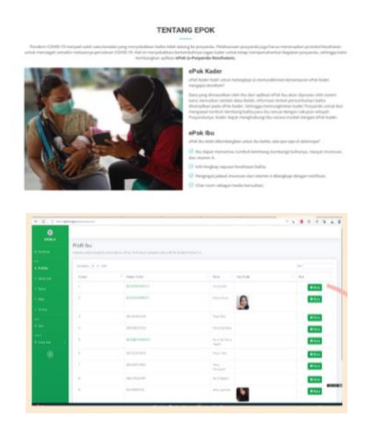
Figure 1. Appearance of the ePoK-K Application