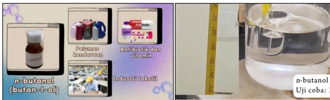
Figure 1. Macroscopic Level Chemical Representation Display

The symbolic level in the video media presents the 2D chemical structures