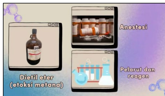
Figure 5. Macroscopic Display in the Second Part of the Video After Revision

For Indicator 2, the content expert commented that the differences between the ether molecules were not apparent, specifically the variation in carbon chain length that affects the size of the electron cloud. The animation of the intermolecular structures was revised to be larger, making the carbon chain length differences more visually clear.