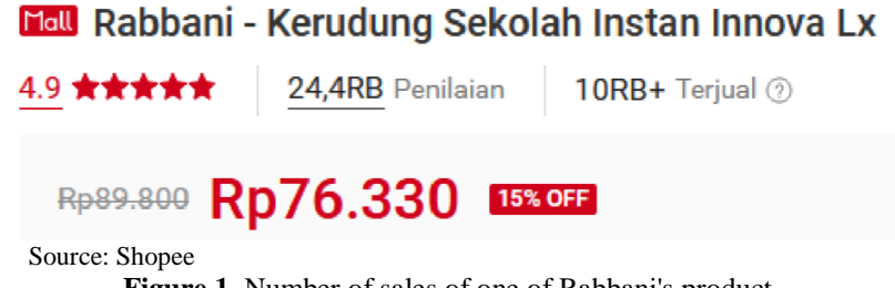
Figure 1. Number of sales of one of Rabbani's product

Rabbani, the first company to introduce instant hijab products, currently has various models of instant hijab types. However, this is used by irresponsible people who steal Rabbani's product designs, then sell them at a much lower price. The number of sales of original Rabbani products and counterfeit products is similar. The number of sales can be seen in the image below.