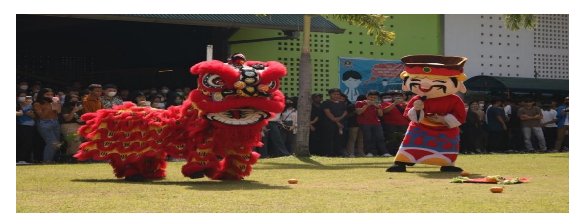
Figure 4. Barosngsai performance at Don Bosco High School Padang

The figure above shows a picture of Barongsai . Barongsai is a traditional Chinese dance that is interpreted as a lion and is a symbol of courage, luck, and fighting spirit. This performance is