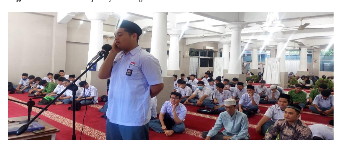
Figure 3. Muslim students participate in religious activities

This figure captures a moment of togetherness, harmony, and students' pride in their religious identity. It paints a picture of a school environment that supports and celebrates diversity, where every student has the space to express his or her religious beliefs with pride and respect for others.