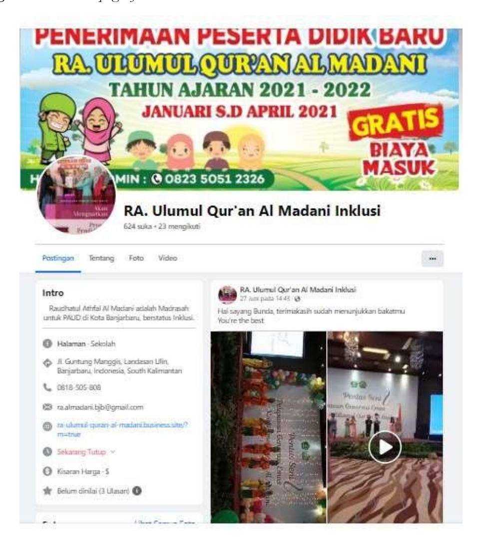
Figure 2. Facebook page of RA Al-Madani

The Headmaster of RA Al-Madani stated that the success of inclusive education depends not only on the relationship between the school and parents but also on the relationship with the broader community. They understand the importance of collaborating with various entities to enhance their services and expand their reach to a wider audience. These entities include the Ministry of Religious Affairs, the Department of Education, the Department of Social Affairs, the Department of Transportation, Clinical Psychologists providing Neurofeedback Therapy (NF Therapy), Educational Psychologists conducting Psychological Testing (Psychotesting), School Counselors offering Individual or Group Counseling, teacher special education Coordinators for Developmental and Academic Assessments, School Committees, Class Associations, and Learning Places that can be utilized for exemplary theme-based learning. By collaborating with these entities, RA Al-Madani can provide comprehensive services that meet the diverse needs of its students and foster an environment supportive of inclusive education. The RA headmaster stated, "Effective public