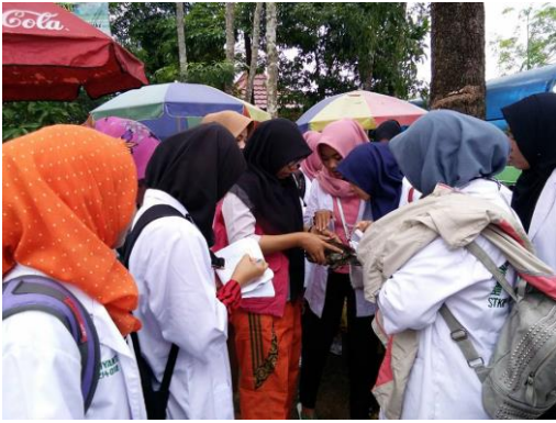
Figure 6. Biology education student stkip PGRI Lubuklinggau learned about turtle morphometrics in aur lake recreation area.

Research team introduce to college student about types turtles found in lake Aur, then college student do measurement from long and wide carapace, long and plastron width, determine type sex turtles, as well team researcher too deliver that the need keep population turtles in the Aur lake so its natural habitat not lost.