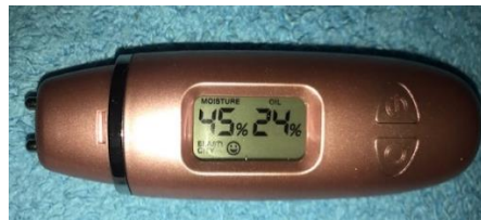
Figure 2. Skin analyzer