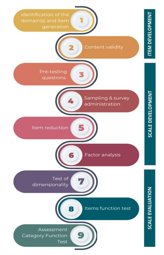
Figure 1. Scale development procedure