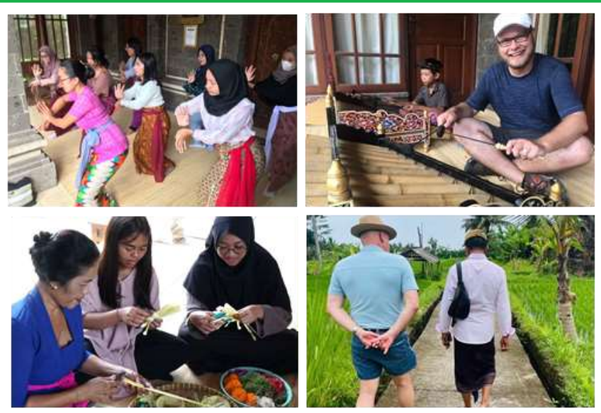
Figure 2. Additional Activities on Gastronomy Tour Packages

Based on observations that have been carried out, the facilities used in gastronomic tour packages in Bakas Tourism Village are very sufficient and have good quality. This tour package also has great potential to introduce Balinese culture to tourists visiting Bakas Tourism Village, because the tour package provider also has a purpose to preserve Balinese culture.