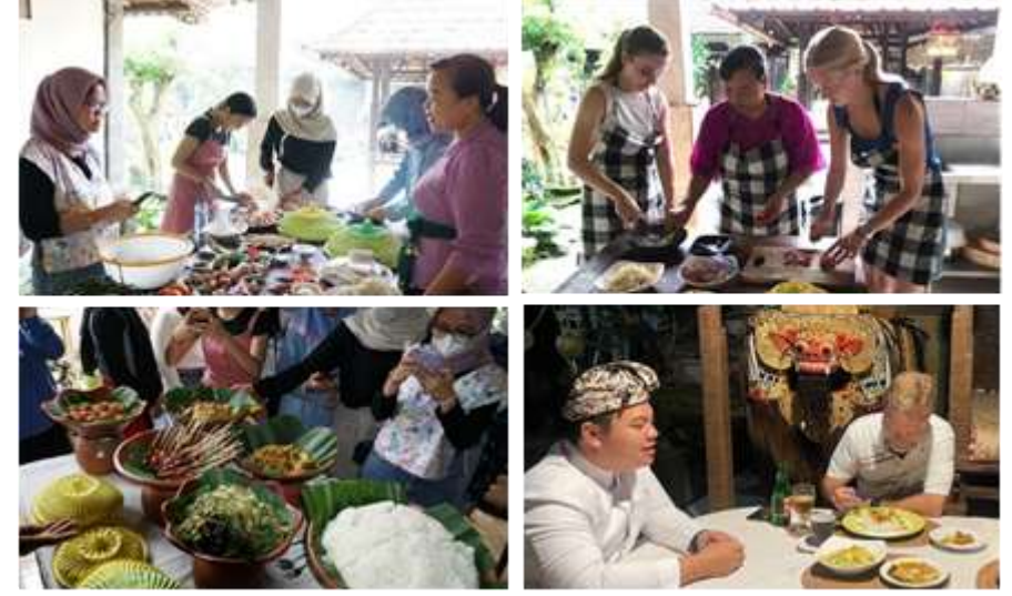
Figure 1. Activities on the Gastronomy Tour package

Based on the analysis that has been done on gastronomy tour packages in Bakas village, it is known that the products of gastronomy tour packages in Bakas village already reflect the definition of gastronomy itself. Starting from before the cooking process, tourists are introduced to the food ingredients that will be made later. Then, tourists are invited to shop at the traditional market which is located not far from the place used to make food. This activity certainly helps to improve the economy of the surrounding community, especially the sellers in the traditional market. After shopping, the tourists are invited back to the kitchen to start processing and cooking the ingredients that have been prepared, that's where tourists learn to carry out the process of making food until it is ready to be served. Then, tourists can start to eat after they finish the cooking process.