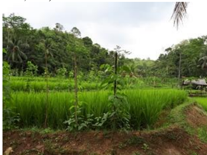
Figure 3. Rice field and vegetable in the dike irrigated by watercourse way from karst hill around the field.

Rice fields was main agriculture in doline (Fig 3); a closed basin where eroded soil accumulated (Radulovic, 2013) forming a thick solum on its surface. The soil thickness in rice fields are up to 50 cm; enabling the cultivation of lowland rice that only requires a maximum depth of plow layer of 40 cm (Wahab, Abdulrachman, Suprihanto, & Guswara, 2017).