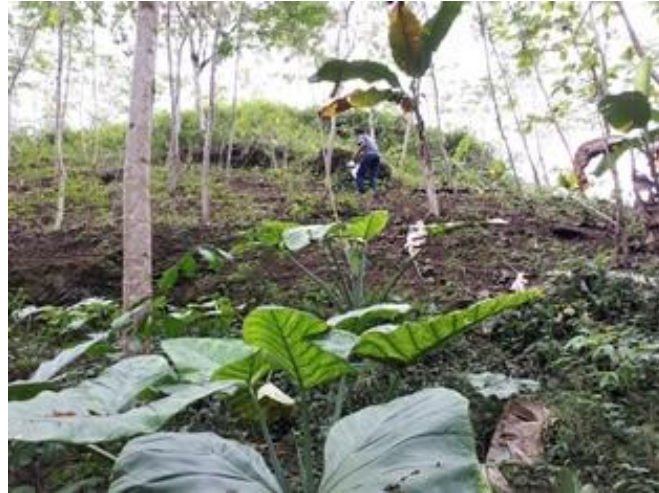
Figure 3. Taro is cultivated by purpose in the ridge of karst hill where the community grows sengon as cash crops

At least 34 local trees grow on karst hill between the rocks and in doline (Table 1). Different indigenous trees grow scattered on karst hills. Tree biodiversity in studied area can be categorized into a group of fruit, wood, herbs, and shade-ornamental trees. The type of tree that can adapt in karst depends on the topography (Guo et al, 2017), soil formation (Atalay, 1991) and the physical and chemical properties of limestone (Efe, 2014).