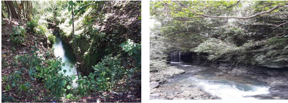
Figure 2. Watercourses way in Karst area at Parakanmanggu Village (left) and Selasari Village (right) in Parigi District