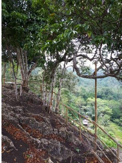
Figure 4. Local tree grown naturally in the top of karst hill in Batulumpang Garden where devegetation leaving the bare rocks

protecting the area and land for food crops agriculture and assuring the availability of sustainable agriculture. Nowadays Pangandaran Regency has not yet Regency Spatial Detail Plan and their zoning regulations. Once the Spatial Detail Plan is put out, the regulation of sustainable agricultural land for food crops should be complied with the plan.