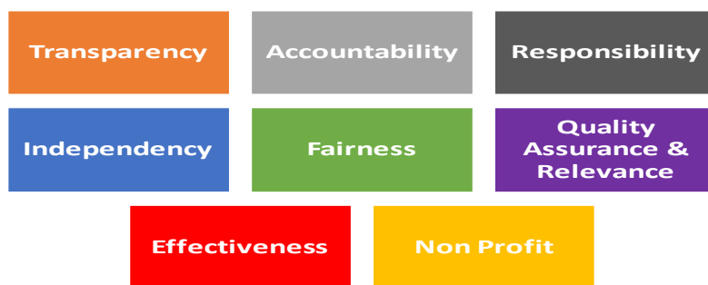
Figure 3. Good university governance

In the context of university governance in Indonesia, there are several principle regulated in Undang Undang Republik Indonesia No.20 Tahun 2003 Pasal 51 (Law of the Republic of Indonesia Number 20 of 2003, Article 51) regarding National Education System related to that the management of higher education unit implemented based on the principle of accountability, responsiveness, and transparency. Then, Peraturan Pemerintah No.17 Tahun 2010 (Government Regulation of The Republic of Indonesia Number 17 of 2010) regarding the implementation of education system intended to ensuring the effectiveness, efficiency and accountability in the management of education (Muhi, 2010). According to the Indonesia Directorate General of Higher Education (2014), university governance aims to establish an accountable university based on eight principles (Figure 3), namely: 1) Transparency; 2) Accountability to stakeholders; 3) Responsibility; 4) Independency; 5) Fairness; 6) Quality assurance and relevance; 7) Effectiveness and efficiency; 8) Non-profit.