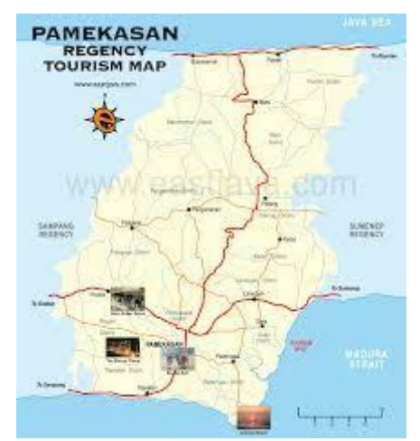
Figure 1. Map of Pamekasan Madura Regency

Talang siring beach is located on Jalan Raya Pamekasan - Sumenep, Pacanan Hamlet, Montok Village, Larangan District, Pamekasan Regency, Madura, East Java. 14 kilometers separate from the city center of Pamekasan from the airport. In Talang siring tourism, there is a great deal of illegal mining along the coast for sale and self-use perfunctory that is used as a building material with low economic value and only a few of which maintain its beauty, specifically in beach resorts, even though if the sand is further processed, it will produce high economic value and has the potential to produce materials with high technology utilization. Insufficient knowledge renders this inherent potential ineffective.